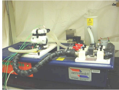
Heat exchanger lab

iLab is dedicated to the proposition that online laboratories - real laboratories accessed through the Internet - can enrich science and engineering education by greatly expanding the range of experiments that students are exposed to in the course of their education. Unlike conventional laboratories, iLabs can be shared across a university or across the world. The iLab vision is to share expensive equipment and educational materials associated with lab experiments as broadly as possible within higher education and beyond.